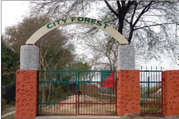
City Forest near I.T. Park, Chandigarh