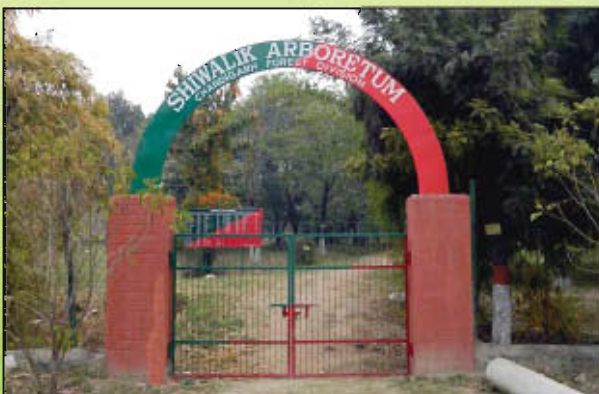
Shivalik Arboretum near Transport Chowk on Madhya Marg, Chandigarh

Forest Department Chandigarh has established an Arboretum near Transport Chowk, Sector-26 Chandigarh. Total area of Shivalik Arboretum is 11 Acres. After taking over the area in 1993-94, the Forest Department took up the challenging task of converting this barren land full with industrial waste into a green belt. Today this Shivalik Arboretum is full of prominent species found in Shivalik region and the citizen can enjoy their presence while walking along the natural trail.