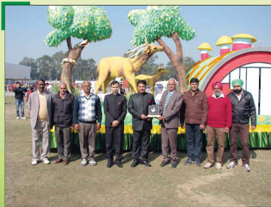
Prize winning Tableau of Department of Forests & Wildlife showcased on 26 th Jan. 2014 on the occasion of Republic Day-2014 in Parade Ground, Sector-17, Chandigarh.