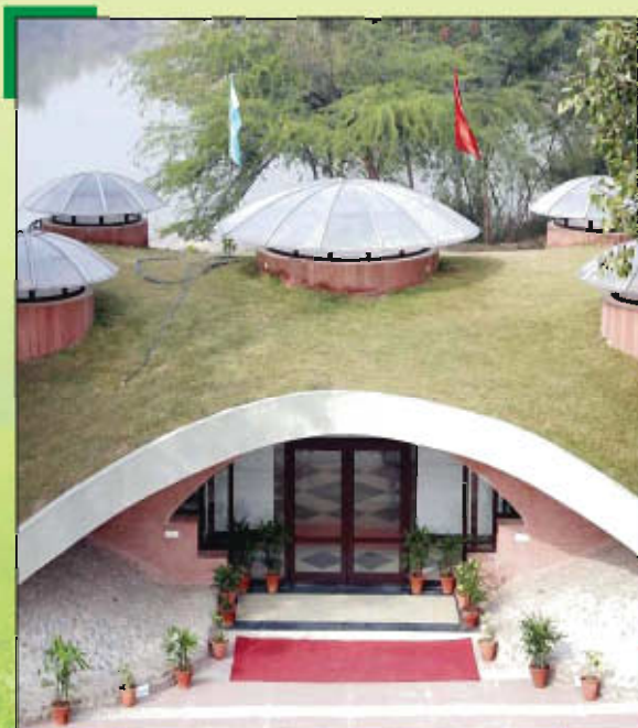
Nature Interpretation Center at Regulator End, Sukhna Lake