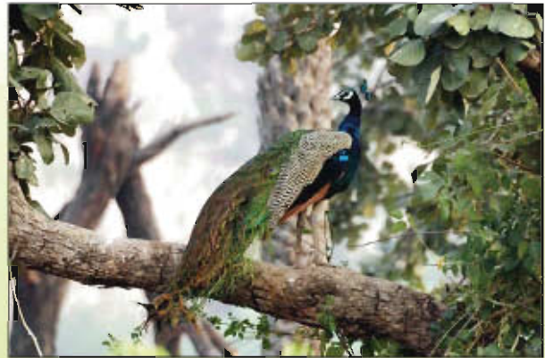
Peacock Park: a Paradise for our National Bird

Department has developed a 5.7 acre green area in Sector-39 as Peacock Park. This area is full of vegetation & a promising habitat for Pea fowls. The area has been fenced from all sides to provide a secluded place for resting of our National Bird. Adequate arrangement has been made for provision of water for the birds inside the Park in the form of artificial ponds. The objective of management in this park is to