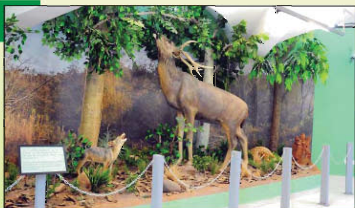
Life Size dioramas of Various Fauna of Sukhna Wildlife Sanctuary, at NIC, Regulator end, Sukhna Lake