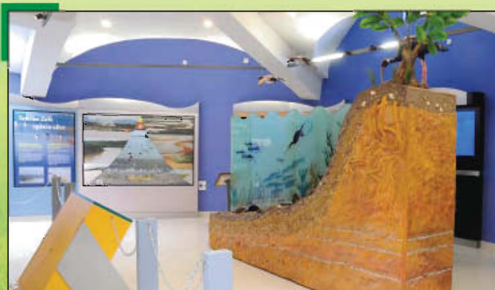
A Model Showing Cross Section of Sukhna Lake & Lake Ecosystem at NIC, Regulator end Sukhna Lake