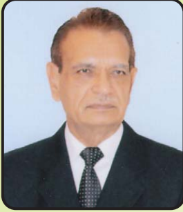
Shivraj V. Patil

Governor of Punjab and Administrator Union Territory, Chandigarh